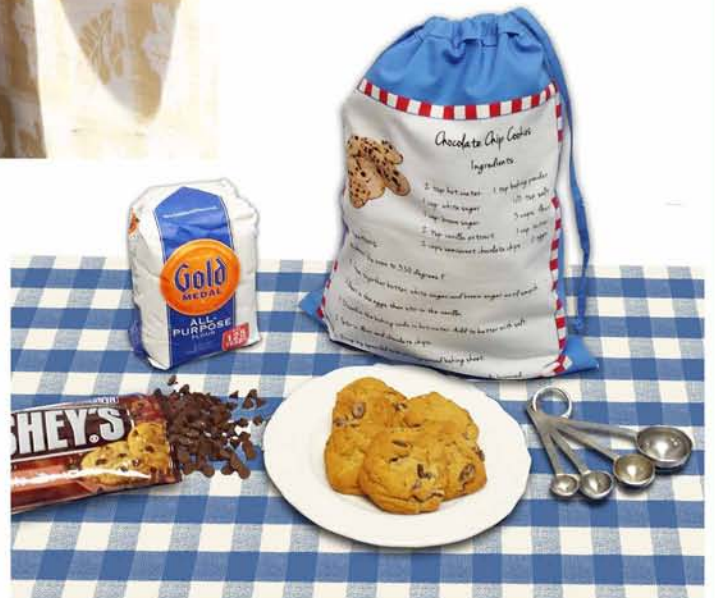
Hostess Recipe Bag

Check www.windhamfabrics.com Free Project section to see if there are any pattern updates before you start your quilt project